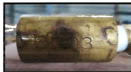
Manifold ID : B 003

NOTES: During testing, visual inspection shows no blot or physical changing on copper tubing. Also, no water leakage between copper connection.