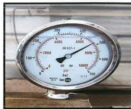
Testing pressure : 450 Bar